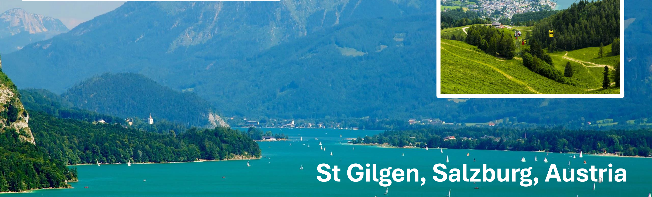
St Gilgen, Salzburg, Austria